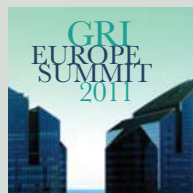
GRI EUROPE SUMMIT 2011 Paris, 7-8 September