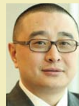
SONG WEI PACIFIC ALLIANCE