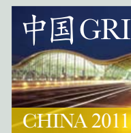
CHINA GRI 2011 Beijing, 2 June