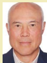
ADRIAN FU KHI HOLDINGS