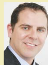
CHARLES DE PORTES REDWOOD GROUP ASIA