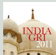
INDIA GRI 2011 Mumbai, 5 October