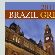
BRAZIL GRI 2011 Sao Paulo, 9 November

www.globalrealestate.org info@globalrealestate.org