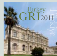
TURKEY GRI 2011 Istanbul, 18 January