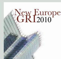
NEW EUROPE GRI 2010 Prague, 23 November