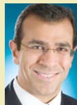
NIEL THASSIM REEF