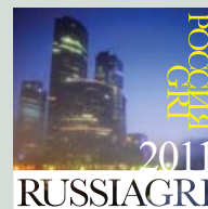
RUSSIA GRI 2011 Moscow, 20 September