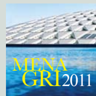
MENA GRI 2011 Sharm El Sheikh, 3 November