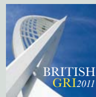
BRITISH GRI 2011 London, 26 May