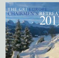
GRI EUROPE CHAIRMEN'S RETREAT 2011 St Moritz, 20-23 January