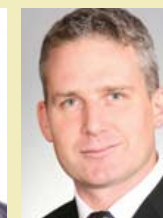
COLIN MACDONALD FINE GRAIN PROPERTY