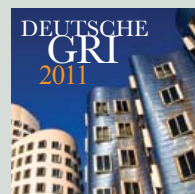
DEUTSCHE GRI 2011 Frankfurt, 3-4 May